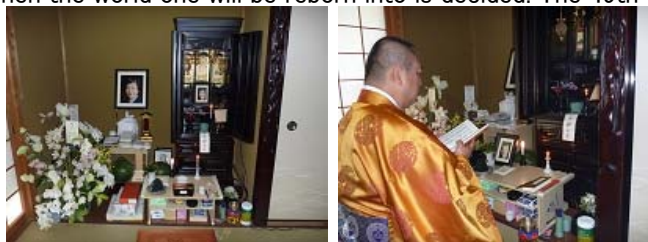
My late wife's Buddhist memorial service on the 49-day-anniversary of her death

And further, when passing away, one is not reborn into the 6 realms at the exact moment of death. There is a certain process which requires 49 days. The period of 49 days passed in a nether-world, neither the present world nor the next, is called 中陰(chuin) or 中有(chuu). When one dies, one enters this intermediate state and travels through this shadowy realm. This is called "traveling to the world of dead." Every 7 days one comes before one of 7 judges and receives a judgment. One's acts while alive are investigated, and where in the 6 realms one will next be reborn is considered. Therefore the bereaved hold a ceremony on each of the judgment days, lending support in this world so that the dead person might receive favor in the judgments. This is called 回向(eko), the transfer of merit. The 1st judgment is on the 7th day, and this continues every 7 days until the 49th. The 49 day is the day of final verdict, when the world one will be reborn into is decided. The 49th day is called 満中陰(manchuin) and a special ceremony is held on this day. When this custom was transmitted from India to China, 3 days were added: 100 days, 1 year and 3 years. And when Buddhism reached Japan, ceremonies were added for the 7th, 13th, and 33rd anniversaries and there were then 13 ceremonies, and that has continued to the present day. These may be seen as opportunities for a retrial.