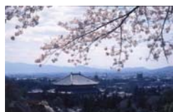
Nara Okuyama Driveway

In Nara there're many famous cherry-blossom viewing sites such as Mt.Yoshino, nice spot to visit, however, I would here prefer to tell you nearby good places to enjoy it. (source: MyTown Nara Vol.515)