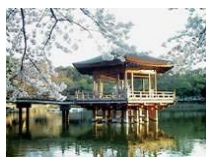
Ukimido, Nara Park