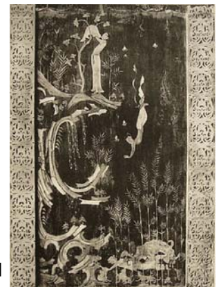
Painting on Tamamushi Shrine symbolizing ritakyusai

Mahayana Buddhism, introduced to China, Korea, Japan and so on, preaching from 利他救済(りたきゅうさい=ritakyusai=emancipation through benefitting others) that all human beings are equally capable of becoming buddhas. Here, the salvation idea was taken in. An Indian Buddhist monk Nagarjuna ( 150 – 250 AD) who systematized Mahayana Buddhism argued "the essence of Buddhism is mercy or humanity", which led to the Buddhism change from "getting enlightenment" in the original Buddhism to "salvation."